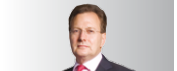
Right Hon. Lord Goldsmith QC PC