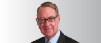
Mr David M Gonski AC