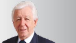
Mr Frank P Lowy AC Chairman