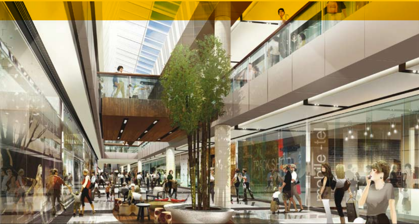
Artist's impression of the planned development

Carindale is ready to enter the next stage, following its resilience over recent years.