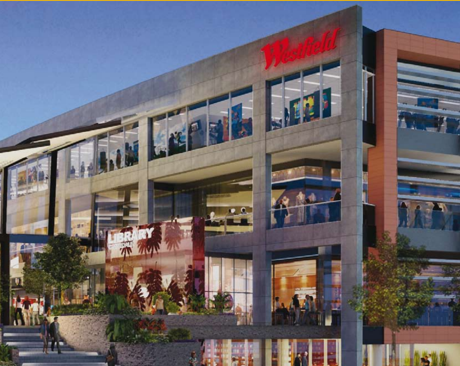
Artist's impression of the planned development