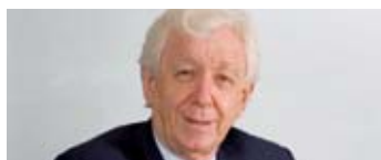
Mr Frank P Lowy AC Chairman