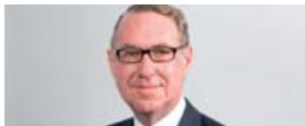
Mr David M Gonski AC